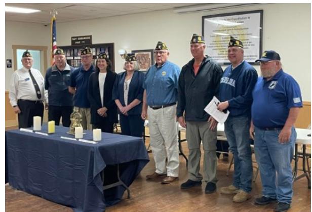
Four Chaplains Remembrance Ceremony

Post 179 held its annual Four Chaplains Remembrance Ceremony on February 3rd, 2024 at the Post. The ceremony honored the four U. S. Army chaplains who sacrificed their lives at sea by giving their life jackets to others after their ship was torpedoed during WWII.