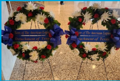
SAL Detachment of Texas Memorial Wreaths