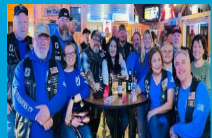
BIAMC Bike Night