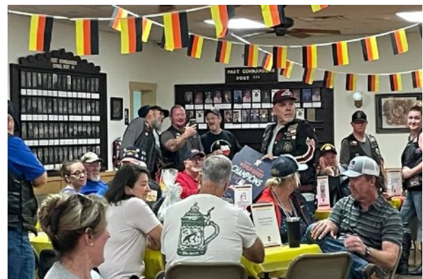
ALR's Fasching Run - See More Photos on Page 4

Finally, many new events are being planned, and we welcome new volunteers! In the upcoming months we have the Air Show at Randolph April 6th to 7th, Folkfest Apr 13th to 14th, an Open House on April 26th, and Boys State graduation on June 14th, 2024. Add these dates on your calendar and plan to volunteer or attend.