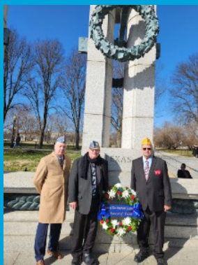
SAL Texas Delegation with Wreath Placed at the Texas Pillar of the WWII Memorial

disappointment was the site’s fountains weren’t running. After a busy and exhausting day, we had a few more informal gatherings to prepare for the business to be officially addressed the following day.