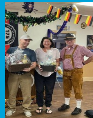
Fasching Masskrugstemmen Champions