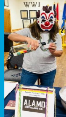
Serving Up Lots of Fun at the Fasching Run